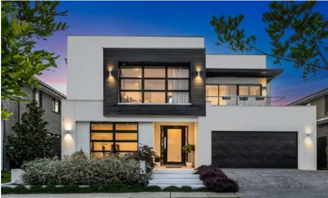
25 San Siro Road, North Kellyville 4 Beds / 3 Baths / 2 Cars $2,175,000