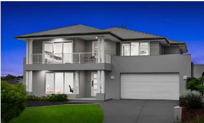
2 Warrumbungle Close, North Kellyville 4 Beds / 2 Baths / 2 Cars $2,231,500