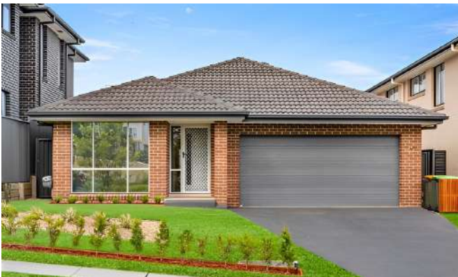
86 Carisbrook Street, North Kellyville 4 Beds / 2 Baths / 2 Cars $1,655,000