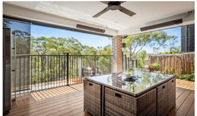
16 Morwell Drive, North Kellyville 5 Beds / 3 Baths / 2 Cars $2,200,000