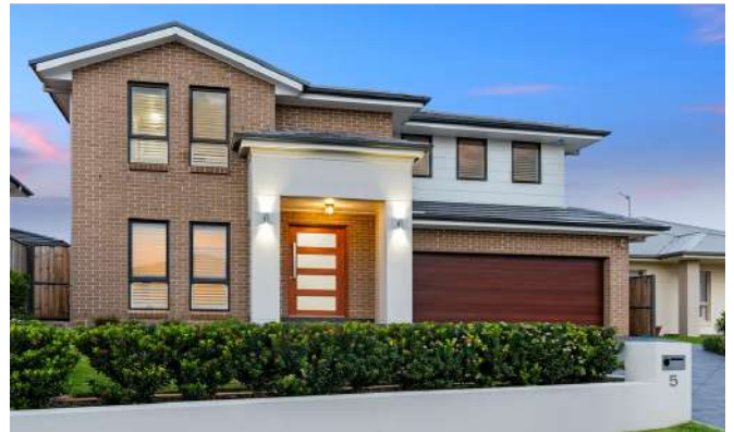
5 Kinglake Street, North Kellyville 5 Beds / 3 Baths / 2 Cars $1,960,000