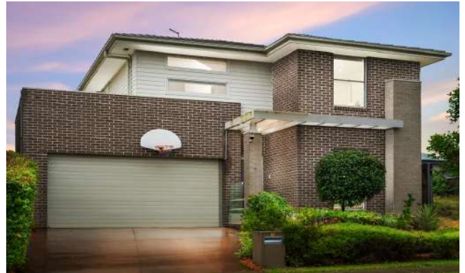
10 Maracana Street, North Kellyville 4 Beds / 2 Baths / 2 Cars $1,520,000