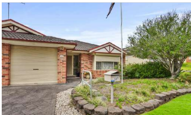
10a Wendy Place, Glenwood 3 Beds / 2 Baths / 1 Car $915,000