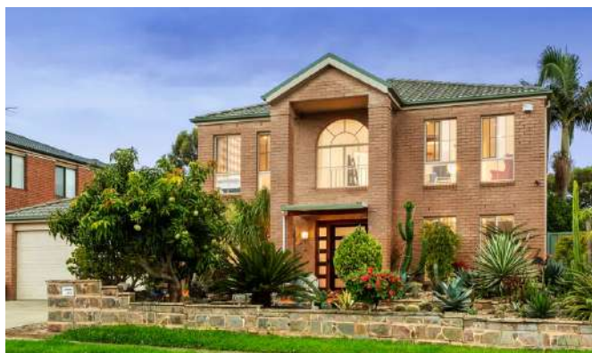
12 Oakleaf Avenue, Glenwood 4 Beds / 3 Baths / 2 Cars $2,010,000