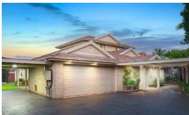
4 Yellowgum Grove, Glenwood 4 Beds / 3 Baths / 4 Cars $1,851,000