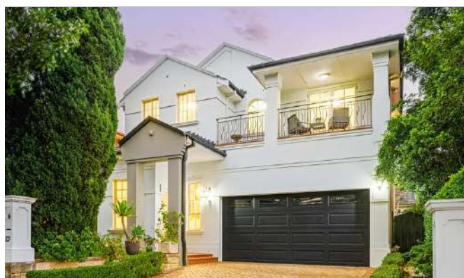
39 Diamond Avenue, Glenwood 4 Beds / 2 Baths / 2 Cars $1,580,000