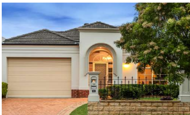
11 Garnet Grove, Glenwood 3 Beds / 1 Bath / 1 Car $1,200,000