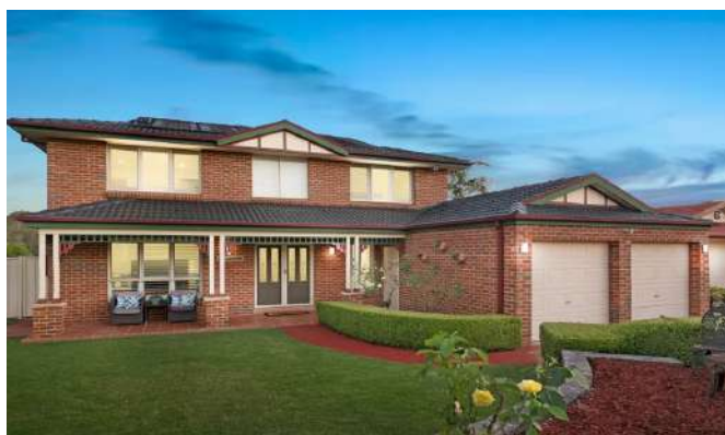
14 Diamond Avenue, Glenwood 7 Beds / 2 Baths / 2 Cars $1,938,000