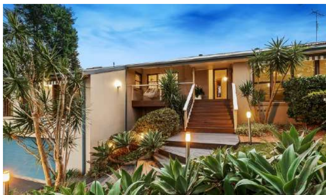
11 Clegg Place, Glenhaven