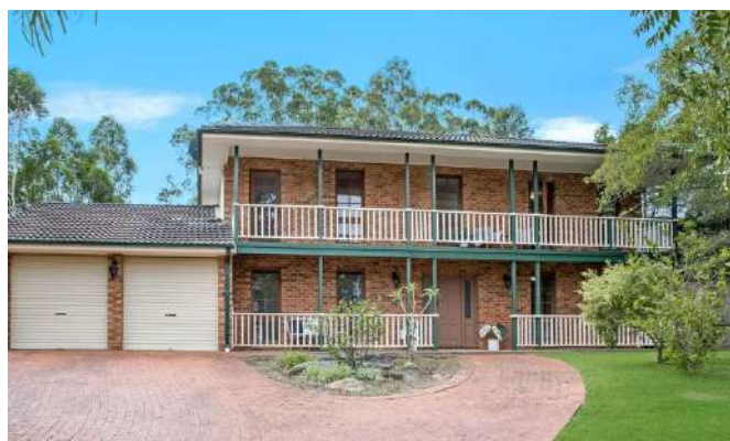
49 Greenbank Drive, Glenhaven