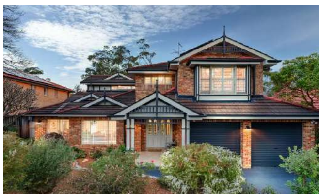
12 Badenoch Avenue, Glenhaven