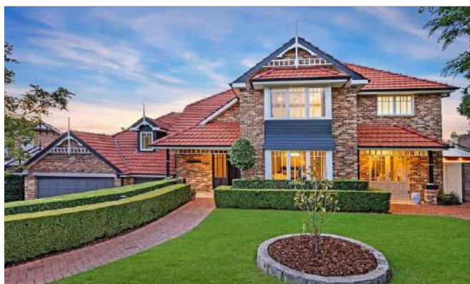
7 Golders Green Way, Glenhaven