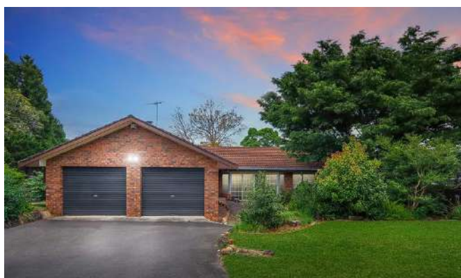
44 Evans Road, Glenhaven