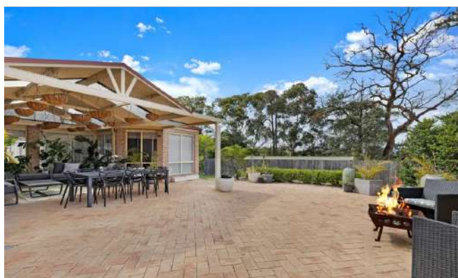
6 Badenoch Avenue, Glenhaven