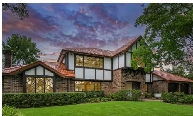
18 Josephine Crescent, Cherrybrook 4 Beds / 3 Baths / 2 Cars $2,725,000