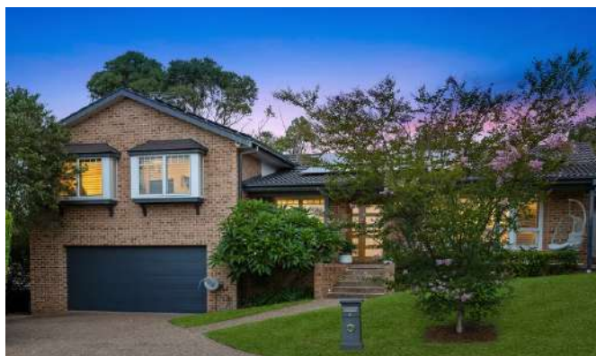
6 Hartree Place, Cherrybrook 5 Beds / 2 Baths / 2 Cars $2,400,000