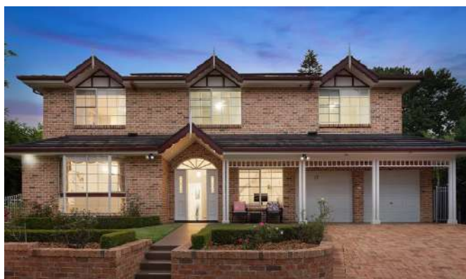
17 Durant Place, Cherrybrook 5 Beds / 3 Baths / 2 Cars $2,772,000