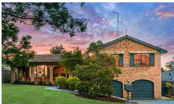
59 Tallowood Avenue, Cherrybrook 4 Beds / 3 Baths / 2 Cars $2,600,500