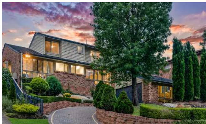
165 Shepherds Drive, Cherrybrook 4 Beds / 2 Baths / 2 Cars $2,300,000