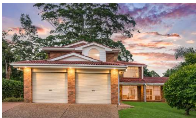
43 Bowerman Place, Cherrybrook 5 Beds / 3 Baths / 2 Cars $2,340,000