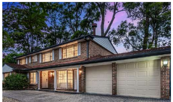
6 Heatherbrae Place, Castle Hill