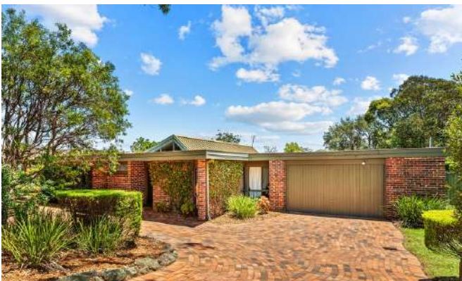
55 Darcey Road, Castle Hill