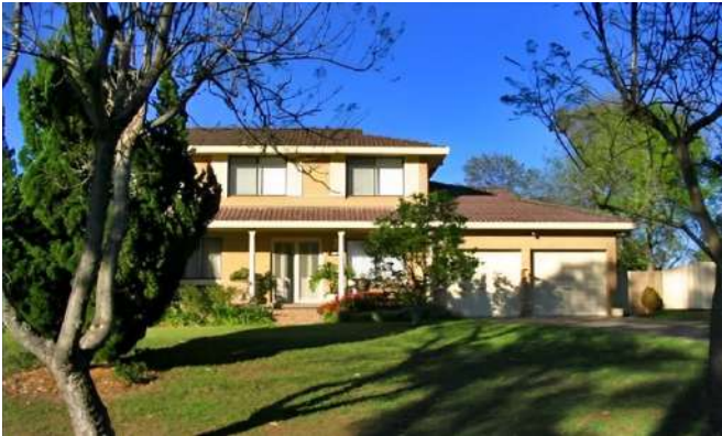
35 Fishburn Crescent, Castle Hill