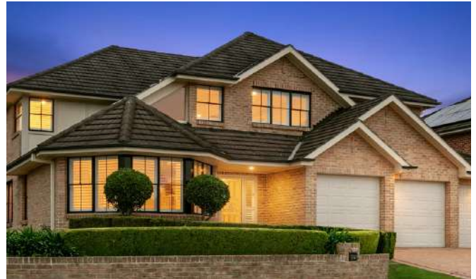
31 Beaumaris Avenue, Castle Hill