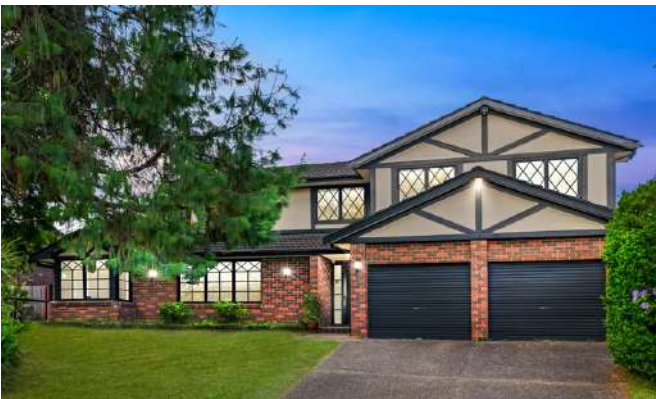
48 Middleton Avenue, Castle Hill