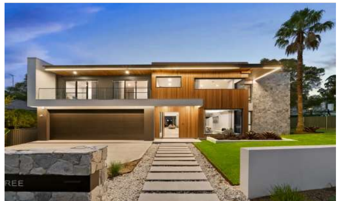
3 First Farm Drive, Castle Hill