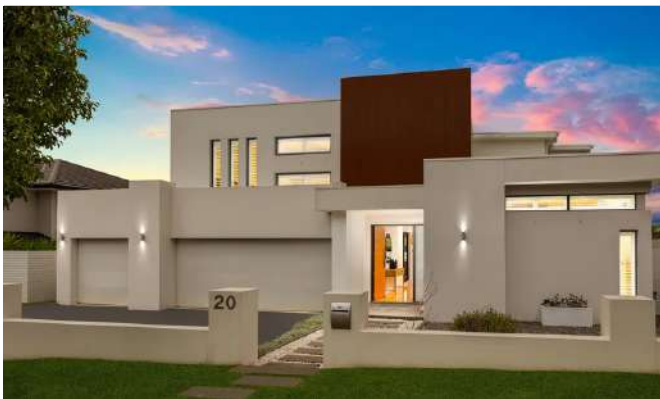
20 Charlemont Terrace, Bella Vista