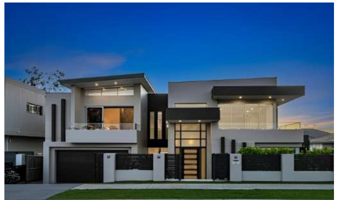
7 Gardenview Court, Bella Vista