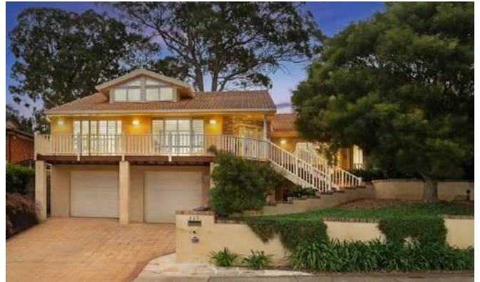
117 Chapel Lane, Bella Vista