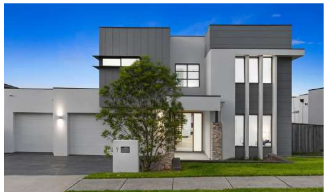
9 Sandstock Way, Bella Vista