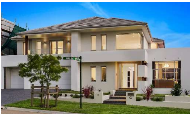
9 Mount Bank Rise, Bella Vista