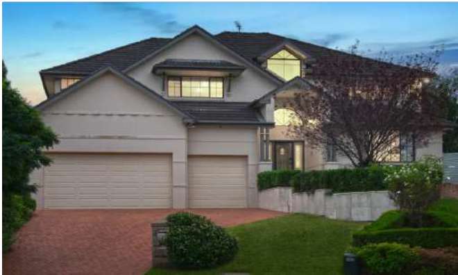
25 Whiteman Avenue, Bella Vista