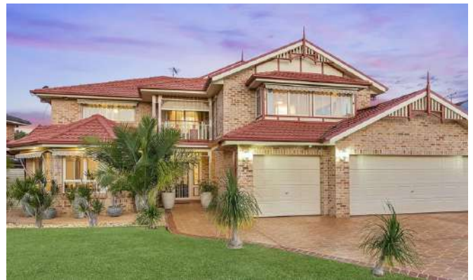
21 Beaumont Drive, Beaumont Hills 5 Beds / 3 Baths / 3 Cars $2,165,000