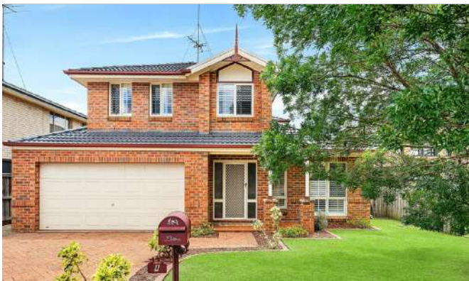
4 Millcroft Way, Beaumont Hills 4 Beds / 3 Baths / 2 Cars $1,660,000