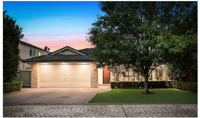
37 Rebellion Circuit, Beaumont Hills 4 Beds / 2 Baths / 2 Cars $1,720,000