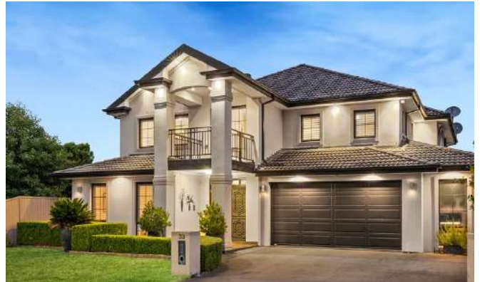
33 Rebellion Circuit, Beaumont Hills 6 Beds / 3 Baths / 2 Cars $2,190,000