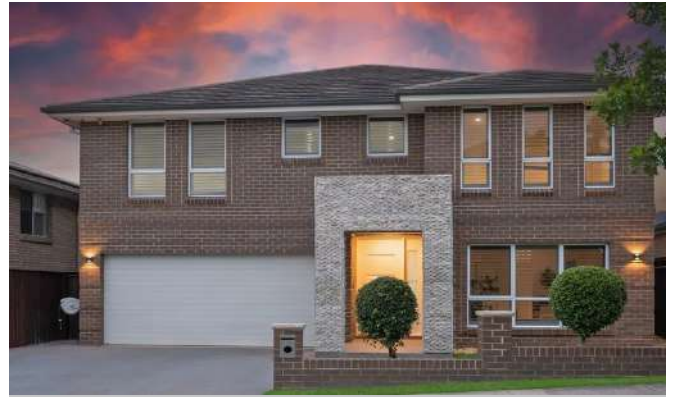
17 Hadley Circuit, Beaumont Hills 5 Beds / 3 Baths / 2 Cars $1,987,000