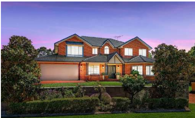
28 Beaumont Drive, Beaumont Hills 5 Beds / 3 Baths / 2 Cars $2,310,000