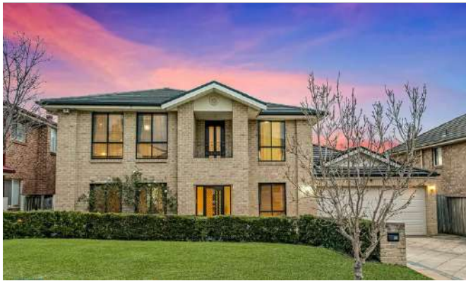
46 Buller Circuit, Beaumont Hills 5 Beds / 3 Baths / 4 Cars $1,960,000