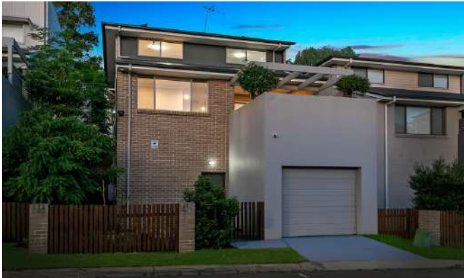
30 Caballo Street, Beaumont Hills 3 Beds / 2 Baths / 2 Cars $1,385,000