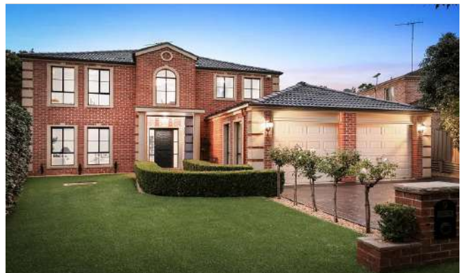
9 Atlantic Place, Beaumont Hills 4 Beds / 2 Baths / 2 Cars $1,840,000