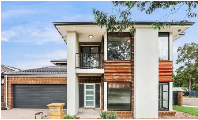
1 Carmargue Street, Beaumont Hills 4 Beds / 3 Baths / 2 Cars $1,699,000