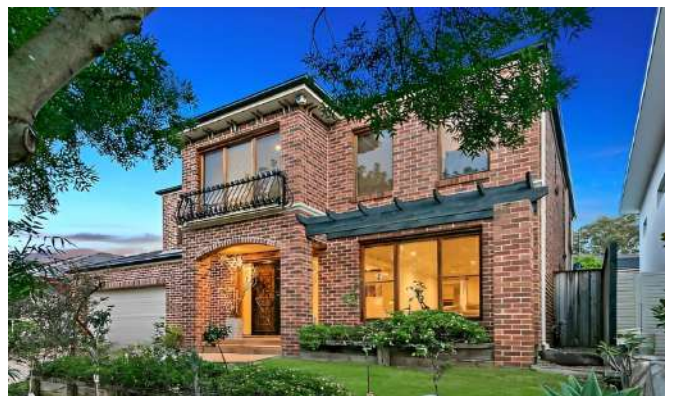
42 Benson Road, Beaumont Hills 4 Beds / 2 Baths / 2 Cars $1,825,000