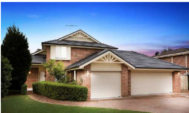
40 Beaumont Drive, Beaumont Hills 4 Beds / 3 Baths / 3 Cars $1,980,000