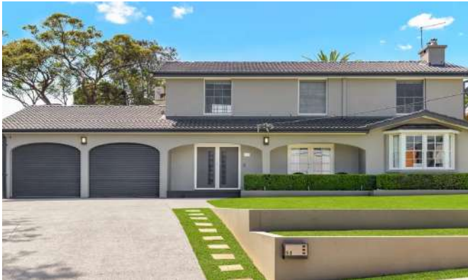
50 Rockley Avenue, Baulkham Hills 4 Beds / 3 Baths / 2 Cars $2,200,000