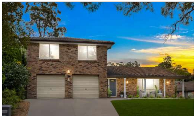
8 Manuka Avenue, Baulkham Hills 5 Beds / 3 Baths / 2 Cars $2,000,000