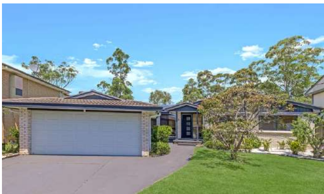
7 Doyle Place, Baulkham Hills 4 Beds / 2 Baths / 2 Cars $1,915,000