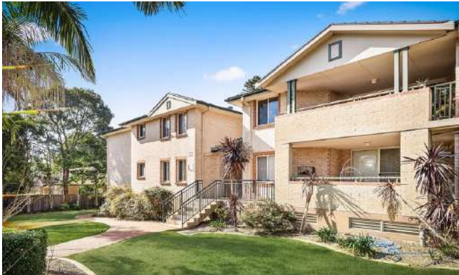
20/13-19 Railway Street, Baulkham Hills 2 Beds / 2 Baths / 1 Car $762,500