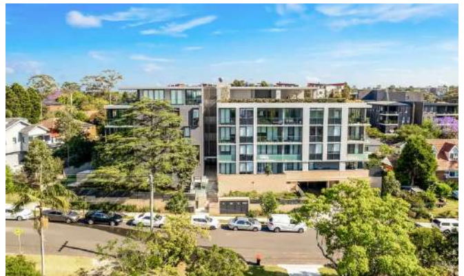
309/41 Yattenden Crescent, Baulkham Hills 1 Bed / 1 Bath / 1 Car $555,000