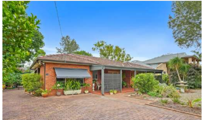
38 Cross Street, Baulkham Hills 5 Beds / 2 Baths / 2 Cars $2,189,888