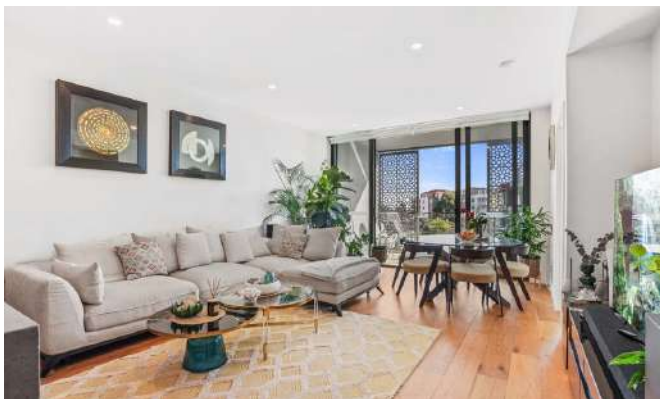
307/41 Yattenden Crescent, Baulkham Hills 2 Beds / 2 Baths / 1 Car $765,000