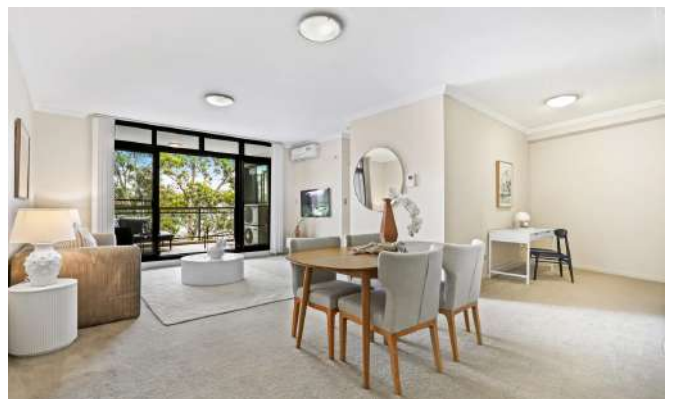
43/1 Russell Street, Baulkham Hills 1 Bed / 1 Bath / 1 Car $472,000