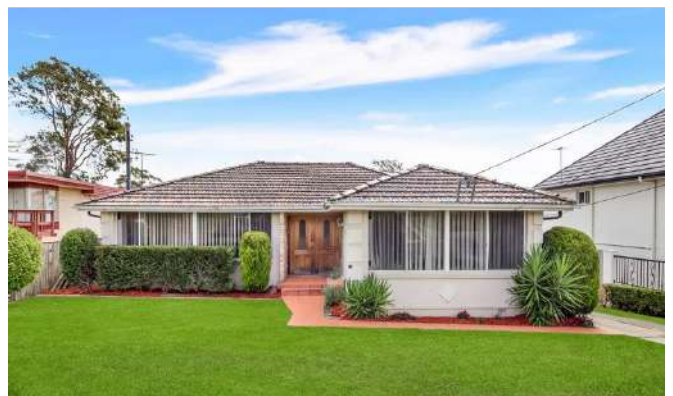
10 Sarah Crescent, Baulkham Hills 4 Beds / 2 Baths / 2 Cars $1,800,000