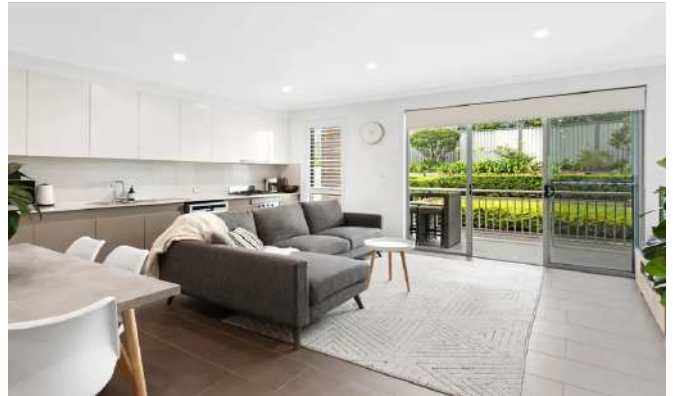
10/1 Woodlands Street, Baulkham Hills 2 Beds / 1 Bath / 1 Car $615,000