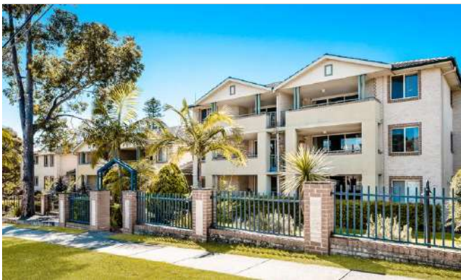
12/13-19 Railway Street, Baulkham Hills 2 Beds / 2 Baths / 1 Car $732,000