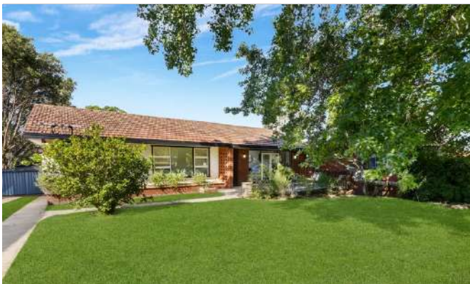
37 Cross Street, Baulkham Hills 3 Beds / 1 Bath / 2 Cars $1,832,000