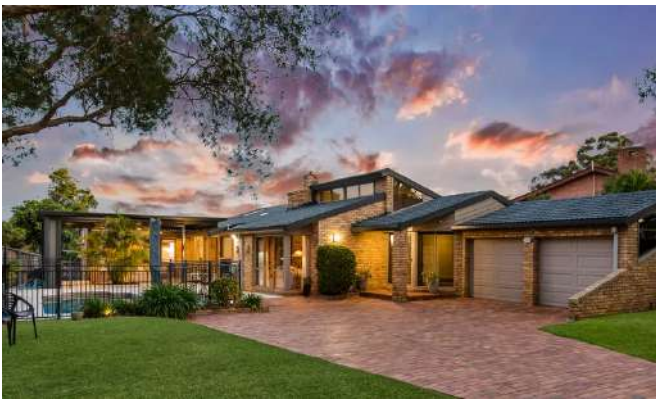
27 Franklin Road, Cherrybrook