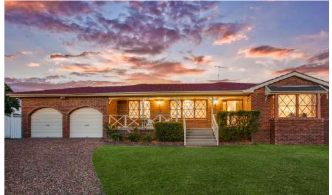
10 Isabel Close, Cherrybrook