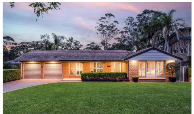
30 Torrens Place, Cherrybrook