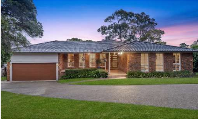
5 Duer Place, Cherrybrook 5 Beds / 3 Baths / 2 Cars $2,601,000