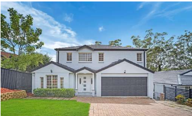
3 Beahan Place, Cherrybrook 4 Beds / 2 Baths / 2 Cars $1,890,000