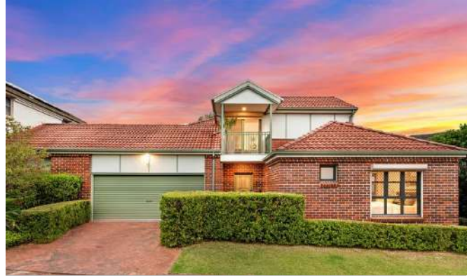
4 Scarborough Way, Cherrybrook 4 Beds / 3 Baths / 2 Cars $2,200,000