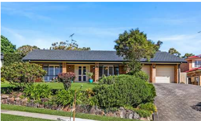
32 Carob Place, Cherrybrook