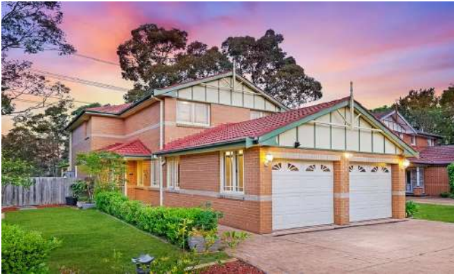
9 Wiltshire Court, Cherrybrook