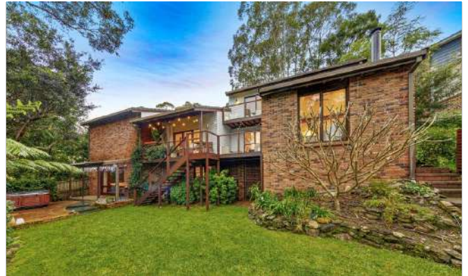
46 Hancock Drive, Cherrybrook 5 Beds / 3 Baths / 4 Cars $2,250,000