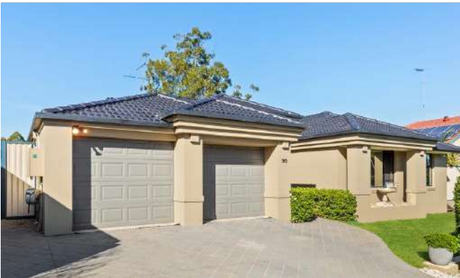
30 Franklin Road, Cherrybrook 4 Beds / 2 Baths / 2 Cars $2,560,000