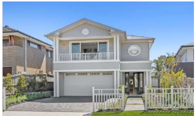
30A Gumnut Road, Cherrybrook 5 Beds / 3 Baths / 2 Cars $3,290,000