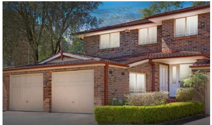
44 John Road, Cherrybrook