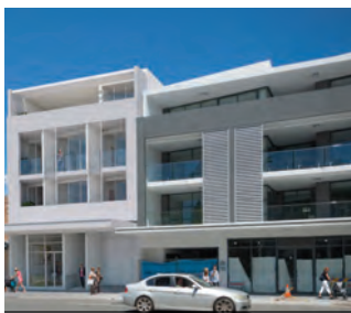
SOLD 1148 Botany Road, Botany DA approved Site