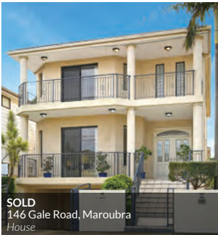
SOLD 146 Gale Road, Maroubra House