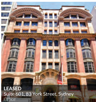
LEASED Suite 601, 83 York Street, Sydney Office