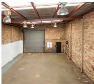
SOLD 21 Luland Street, Botany Industrial