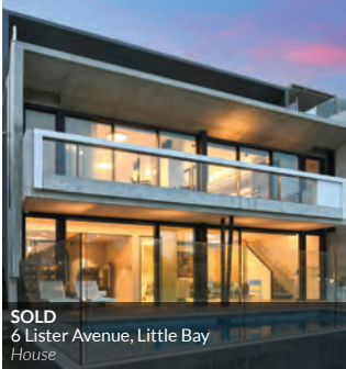
SOLD 6 Lister Avenue, Little Bay House