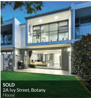
SOLD 2A Ivy Street, Botany House