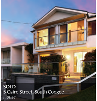
SOLD 5 Cairo Street, South Coogee House