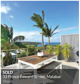
SOLD 33 Prince Edward Street, Malabar House