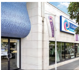
SOLD 360-364 Botany Road, Beaconsfield Commercial/Retail