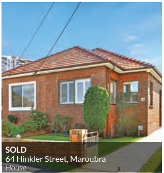
SOLD 64 Hinkler Street, Maroubra House