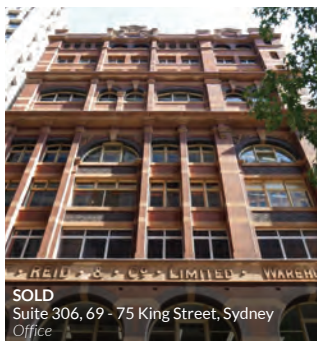
SOLD Suite 306, 69 - 75 King Street, Sydney Office