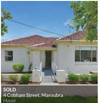
SOLD 4 Cobham Street, Maroubra House