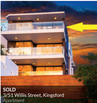
SOLD 3/51 Willis Street, Kingsford Apartment