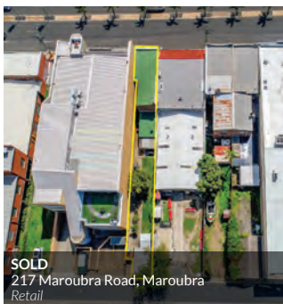
SOLD 217 Maroubra Road, Maroubra Retail