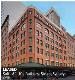
LEASED Suite 62, 104 Bathurst Street, Sydney Office