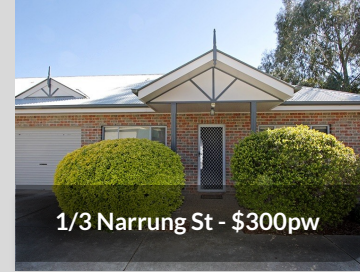
1/3 Narrung St - $300pw