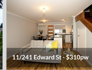
11/241 Edward St - $310pw