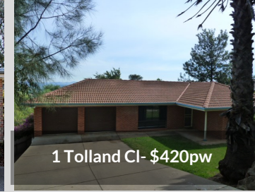
1 Tolland Cl - $420pw