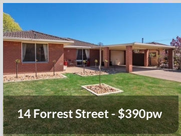
14 Forrest Street - $390pw