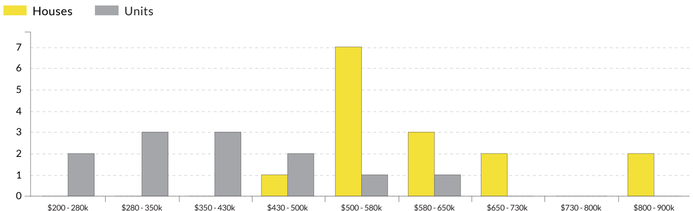
Sales By Price Range (Jun 2020 - May 2021)