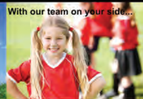
With our team on your side...