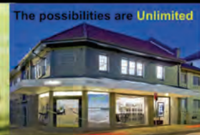
The possibilities are Unlimited

52 Blair Street, North Bondi NSW 2026 Ph: 9365 5888 Fax: 9365 5822 rwunlimited.com.au