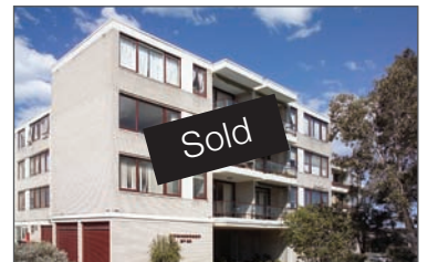
16/89 Broome Street, Maroubra