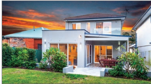
15 Ireton Street, Malabar