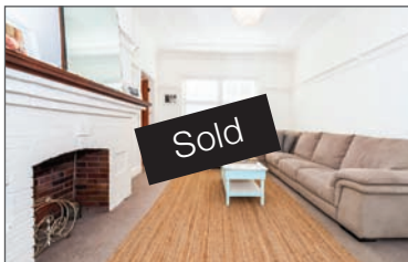
3/172 Botany Street, Kingsford