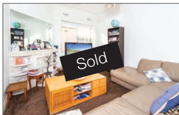
18 Pardey Street, Kingsford