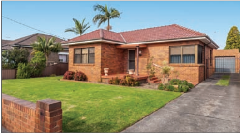
24 Robinson Street, Eastlakes