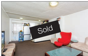
5/28 Brittain Crescent, Hillsdale