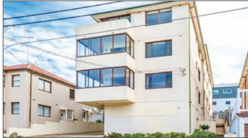
1/30 Bona Vista Avenue, Maroubra