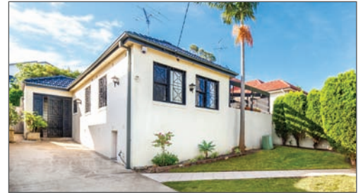
190 Banksia Street, Pagewood