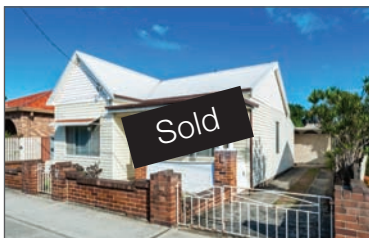
29 Hastings Street, Botany