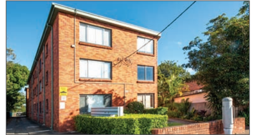
19/1074 Botany Road, Botany