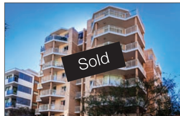
23/108 Boyce Road, Maroubra