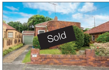
58 Vernon Avenue, Eastlakes