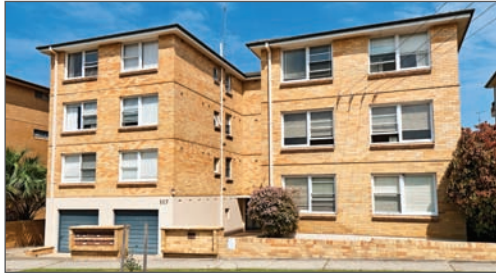
1/113-117 Duncan Street, Maroubra