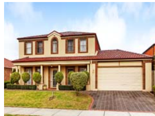
5 Bettina Court Cheltenham