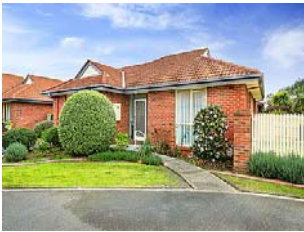
1/28 Howard Road, Dingley Village