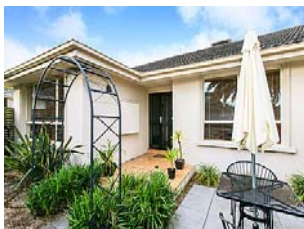
304C Warrigal Road Cheltenham