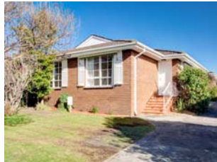
1/71 Chesterville Road Hightett