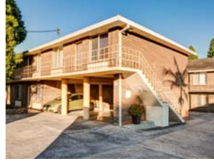
16/131 Cavanagh Street Cheltenham