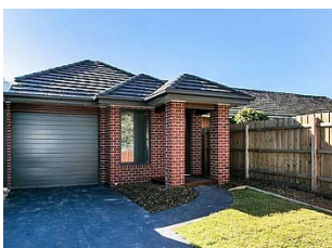
47A Centre Dandenong Road Dingley Village

Would you like to receive our Weekly Market Update email? Click here to join our weekly email list where you will receive news of our listings, current stock and up to date market information.