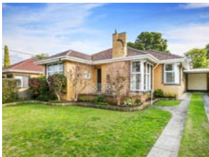
13 Goulburn Street Cheltenham