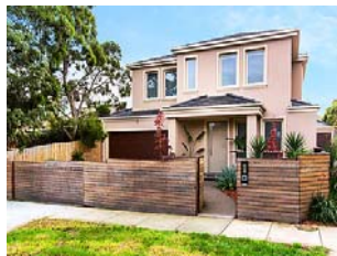
21B Friendship Square Cheltenham