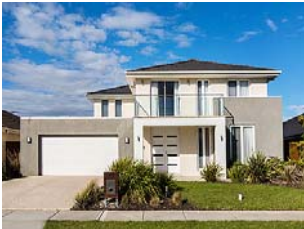
12 Coorong Circle Waterways