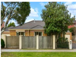
1A Howard Road Dingley Village