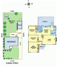
NZS 1219 provides the floor plan to be used for the purpose of the real estate license. Licensed real estate agents are required to ensure that the floor plan is accurate and that it is a true and correct representation of the property.

Section 47AF of the Estate Agents Act 1980